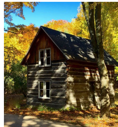
2016 Grant Recipient: The King House